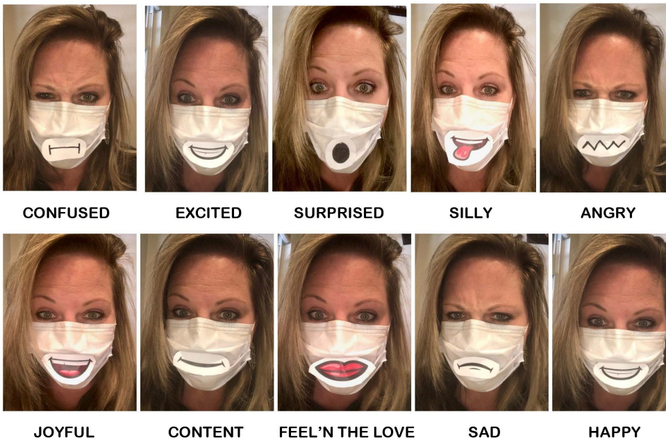
Social Distancing Feelings Chart: A Therapist's Perspective

We have responded by increasing our efforts to support them. Not only have we invested in trainings for our staff, but we have also conducted research on other similar organizations to see how we compared. CBRYC is happy to report that we are at or above the standard for supervision, training, and education for our staff. We are dedicated to continuing this investment in our staff because we know that they are always essential and we would not be able to create connections and inspire change without them.